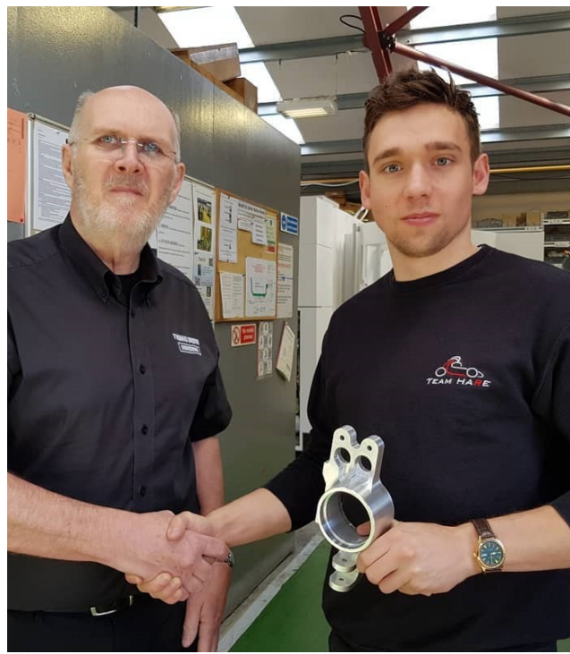
Thomas Brown Engineering machined upright

In the last month, the team has had the pleasure of meeting multiple team sponsors including Thomas Brown Engineering, DENSO, and Thorite. This included the collection of newly machined parts and equipment to assist with the car build. A big success this year is the partnership with Thomas Brown Engineering who have kindly machined all our newly designed uprights, wheel hubs, and wheel nuts. The final quality of the components was fantastic and we couldn't be happier, we look forward to getting them anodised and put on the car.