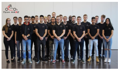
Team Member Introduction